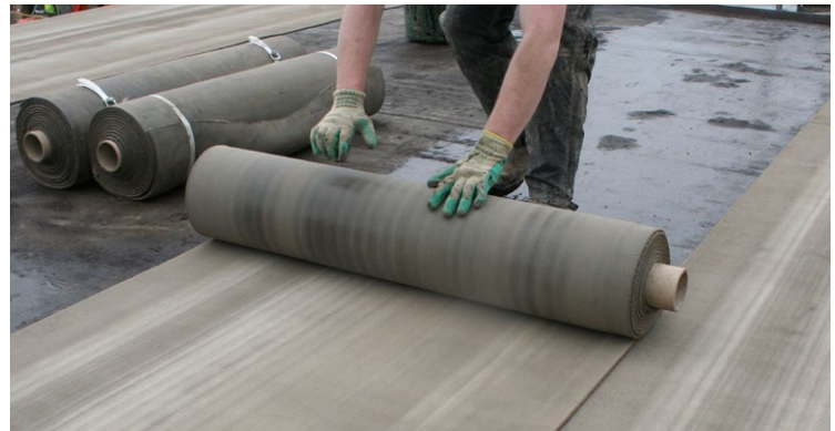
CC Batched Rolls