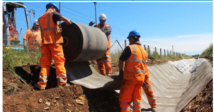
CC Bulk Roll