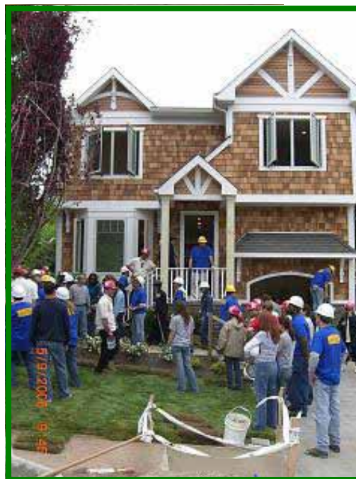
Sod placed over Geoblock while allowing for vigorous growth of turf grass. (continued on page 2)

Presto Products, A Business of Alcoa, donated the Geoblock product as part of a home rebuilding effort on the hit ABC Show, Extreme Makeover Home Edition. This episode, scheduled to air on September 17th, showcases the Geoblock units as part of a landscaping feature to provide protection to grass under vehicle loads in a driveway turnaround area. Designers wanted to maximize the yard's green space while providing a means to turn vehicles and allow homeowners to safely exit onto a busy street. The Geoblock system is a series of interlocking, high-strength blocks made from recycled plastic materials. The system is designed to handle the most demanding turf protection and load support requirements